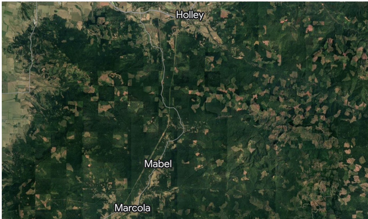
Fig. 2: Satellite image from Google Maps showing fragmented forest surrounding Big League Project Area

4. Through the Big League Project, the BLM is proposing to largely remove the last mature forest habitat in the area—the few forest stands in the region left with large, old trees and functioning wildlife habitat—through “regeneration harvest,” colloquially known as