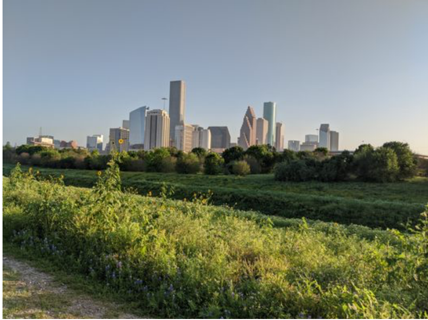
Downtown view from the White Oak Bayou Greenway trails.

87. Apart from the direct use of parts of the Section 4(f) land described in the preceding paragraph, the NHHIP, Section 3 highway would, through its impact on noise levels, scenery, night-time lighting, and air emissions substantially impair the rural ambience of the parkland at White Oak Bayou Greenways and thereby “use,” within the meaning of § 4(f) of the Department of Transportation Act, 49 U.S. § 303; see also 23 U.S.C. § 138, a substantial additional portion of the parkland.