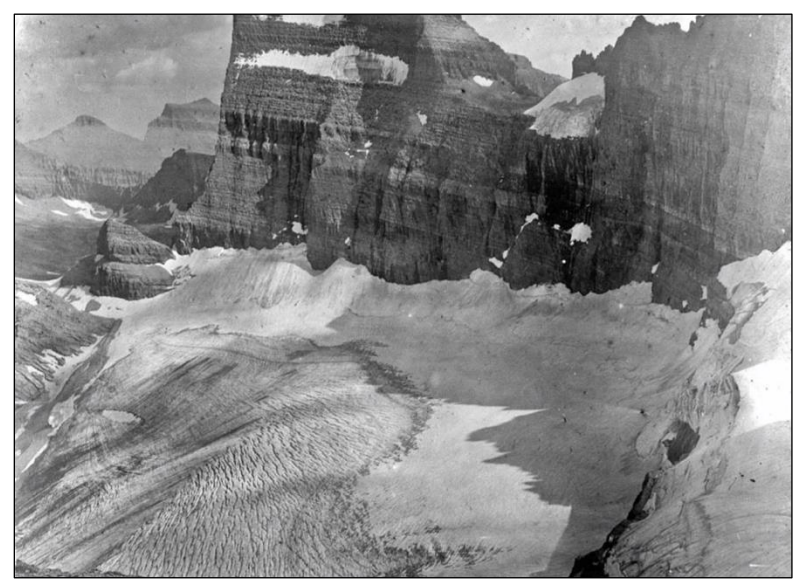
Grinnell Glacier, 1910