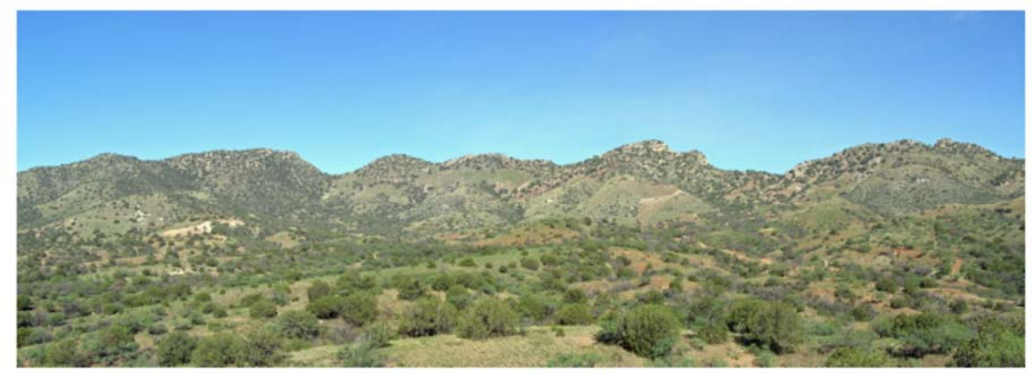
Panorama of the Future Site of the Rosemont Copper Mine (Aug. 2008)

sharply undulating ridgelines.<sup>301</sup> This landscape has high scenic integrity and was designated as a Traditional Cultural Property ("TCP").<sup>302</sup>