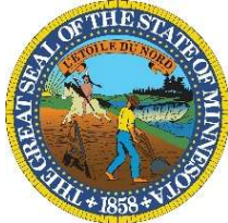
KEITH ELLISON Attorney General