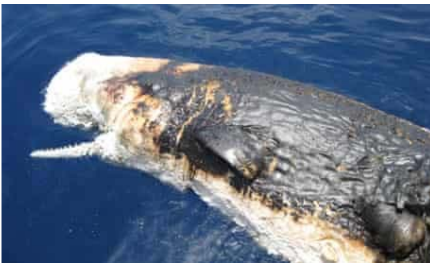
A dead sperm whale following the Deepwater Horizon oil spill.

89. Oil spills not only harm wildlife, but public health, commercial fisheries, tourism, and recreation. For example, following the 2015 Plains pipeline spill, the California Department of Fish and Wildlife closed 138 square miles of marine waters to fishing and shellfish harvesting, two State Parks were closed, and the Governor declared a state of emergency in Santa Barbara County. And the 2021 Platform Elly pipeline spill closed approximately 650 square miles of marine waters to fishing; closed 45 miles of