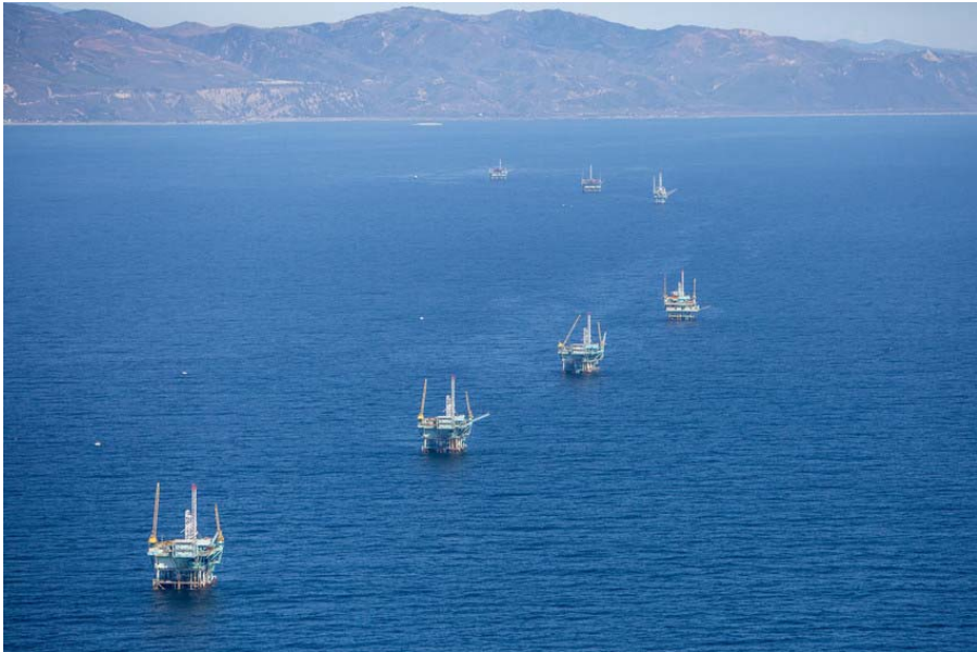
Oil platforms off California.

67. Of the 23 platforms on the Pacific OCS, 15 platforms are operational, while eight are on leases that are no longer active. Of the operational platforms, 11 are in the Santa Barbara Channel and four are off Huntington Beach (one of which is a processing facility).