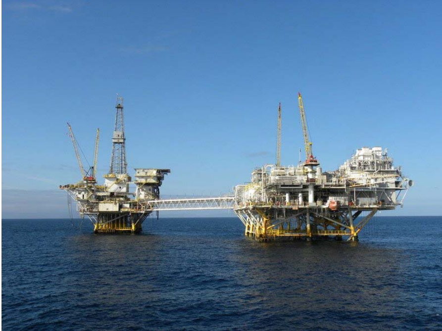
Platforms Ellen and Elly off Huntington Beach.

1 2 3 4 5 6 7 8 9 10 11 12 13 14 15 16 17 18 19 20 21 22 23 24 25 26 27 28